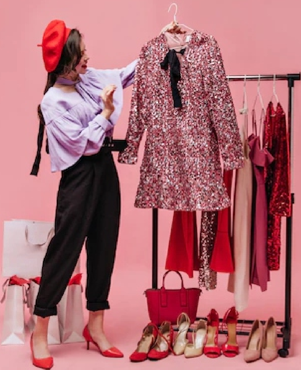
Share Of Indian APPARELS Market